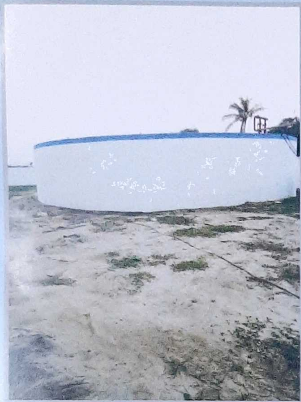
COLLECTION SUMP FOR 2.5 MLD SEWAGE TREATMENT PLANT CLIENT: PARADEEP PORT TRUST