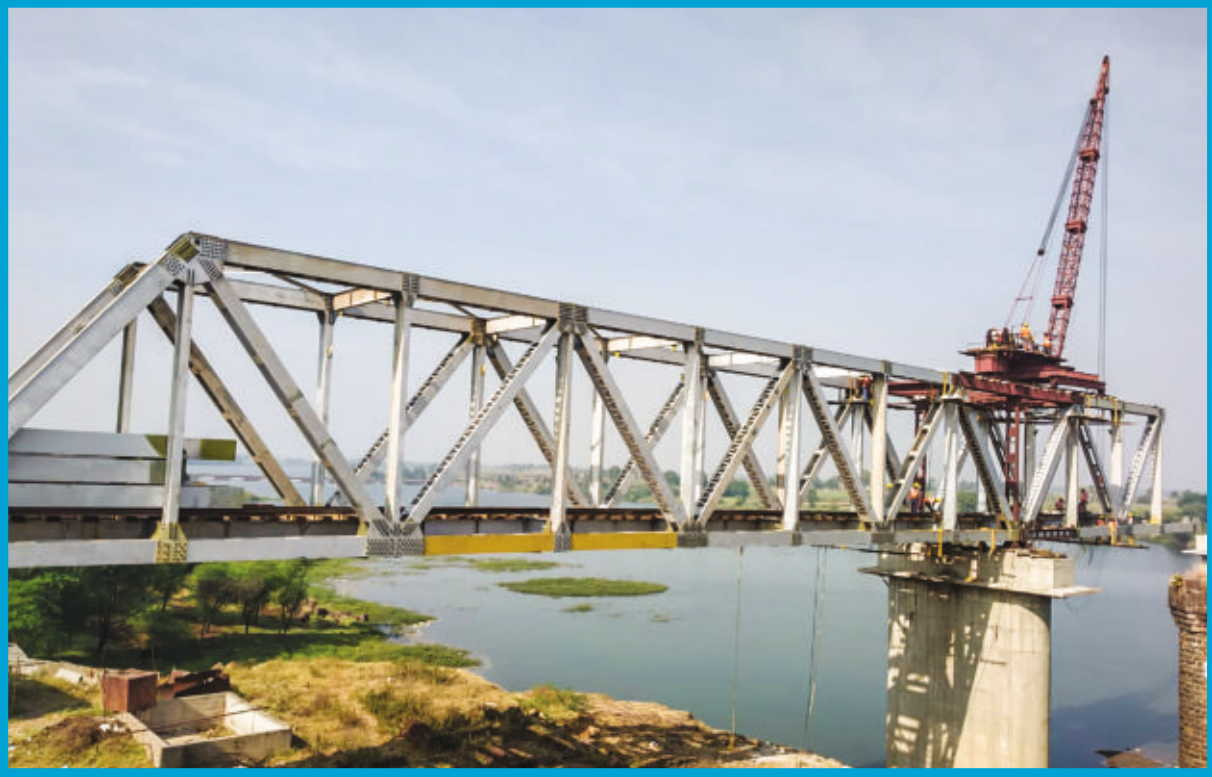
कर्नाटक में लोंडा मिराज परियोजना के लिए स्टील ब्रिज का निर्माण कार्य Construction work of steel bridge for Londa Miraj Project at Karnataka