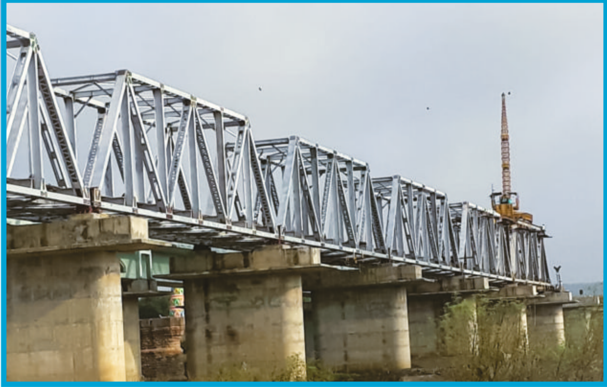
कर्नाटक में गडाग होटगी परियोजना के लिए स्टील ब्रिज का निर्माण कार्य Construction work of steel bridge for Gadag Hotgi Project at Karnataka