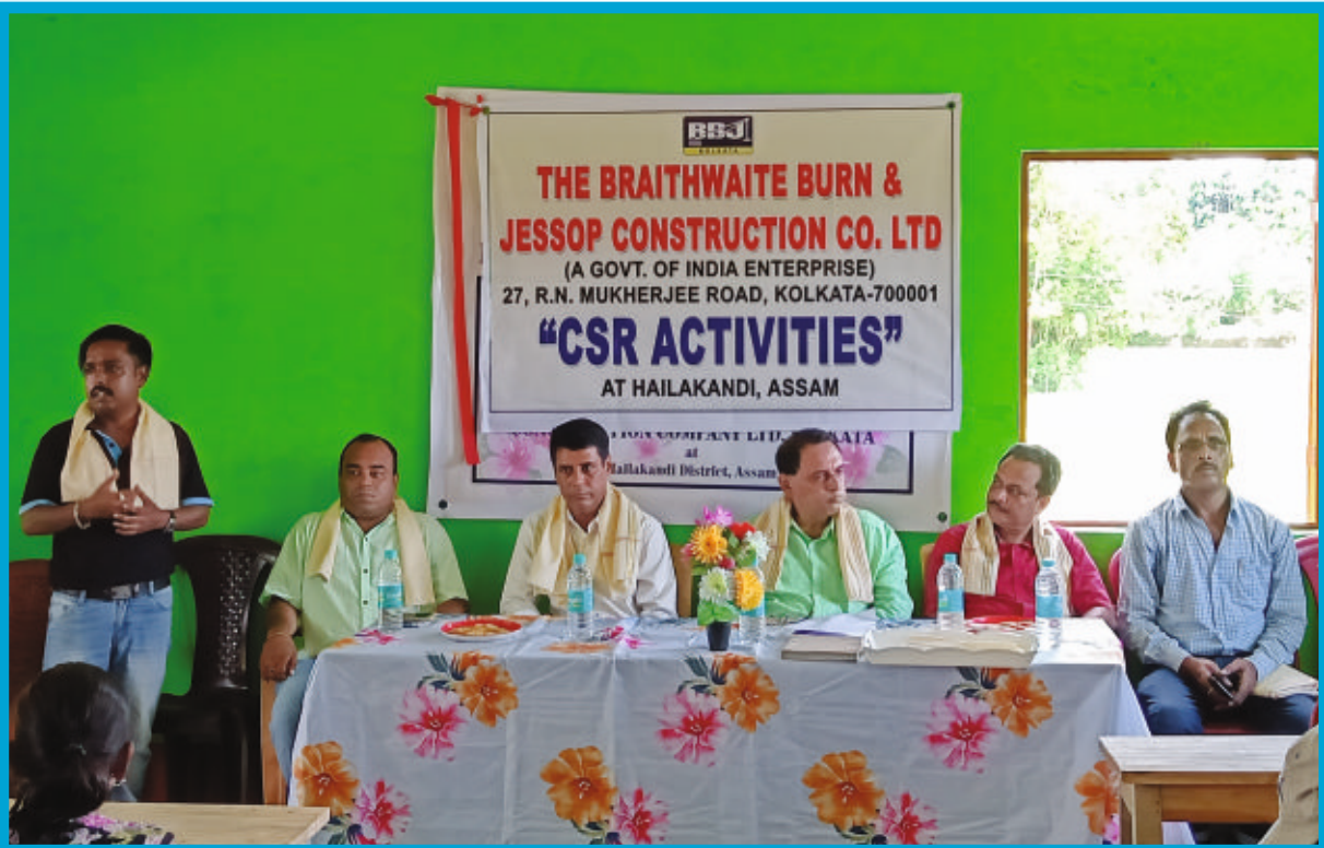
हैलाकांडी, असम में 2019-20 के लिए सीएसआर गतिविधियाँ CSR activities for 2019-20 at Hailakandi, Assam