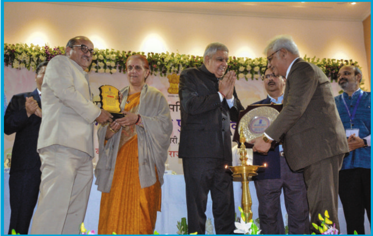
हिन्दी गृह पत्रिका : “बीबीजे दर्पण” प्रथम पुरस्कार से सम्मानित । अ. एवं प्र.नि., बीबीजे पश्चिम बंगाल के माननीय राज्यपाल से राजभाषा शील्ड प्राप्त करते हुए परिलक्षित हैं । Hindi House magazine : “BBJ Darpan” conferred with First prize. CMD, BBJ receiving the Rajbhasha Shield from Hon'ble Governor, West Bengal