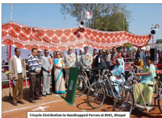
Tricycle Distribution to Handicapped Person at BHEL, Bhopal

6.5 Efforts are made by the CPSEs to follow the instructions issued by the Government from time to time to promote the welfare of persons with disabilities. Persons with disabilities are provided facilities like special conveyance allowance, ground floor residential accommodation, exemption from payment of professional tax, to and fro transportation facilities, provision of medical equipments and general medical assistance. The visually handicapped persons are provided Braille symbols and are engaged in running telephone booths, repair of cane chairs etc. Special Schools are being run for mentally challenged children & visually handicapped persons. These facilities are being provided to enable them to discharge their duties and facilitate their integration into the mainstream workforce.