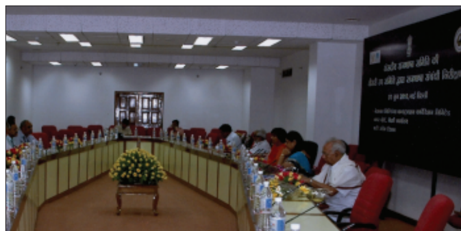
Meeting of Committee of Parliament on Official Language on 1st June, 2010.

during which several competitions including Speech, Translation from English to Hindi and vice-versa, General Hindi Knowledge, Noting & Drafting, Hindi Poem Recitation etc. were also conducted. Staff of the Department participated in these activities with keen interest. Awards were given to meritorious candidates by Hon'ble Minister of State (Heavy Industries and Public Enterprises). Workshops were also organised for officers/employees. Besides, the programme of learning Hindi through “AAJ KA SHABD” and AAJ KA VICHAR” is being implemented actively. An E- Patrika has also been launched on intranet of the Department. It contains articles and poems as well as information on departmental activities.