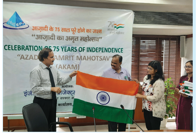
CAMPAIGN HAR GHAR TIRANGA