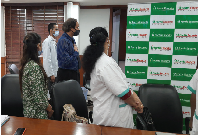
HEALTH CHECK-UP CAMP