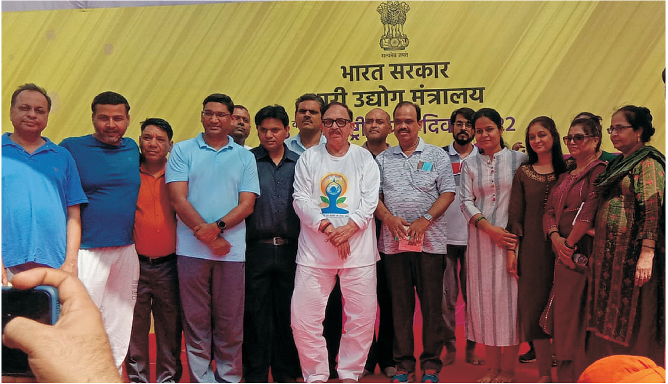
YOGA WITH HON'BLE MINISTER OF MHI