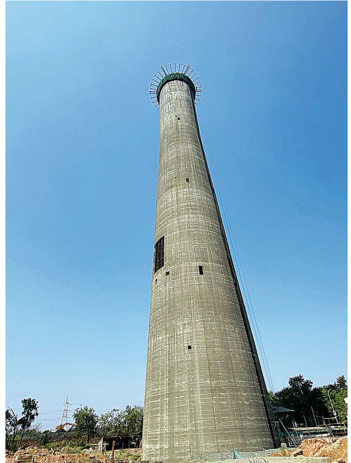
NTPC FGD RAMAGUNDAM PROJECT