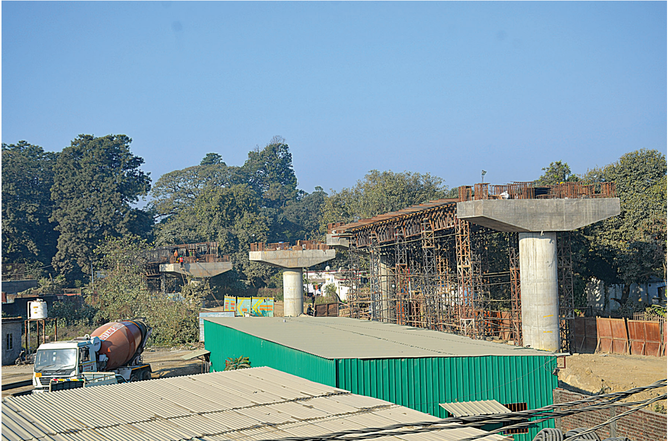
ROB PROJECT DEHRADUN