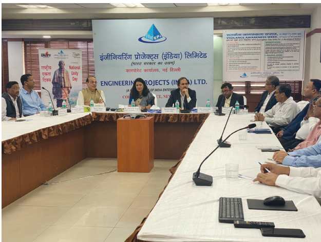
VIGILANCE AWARENESS WEEK