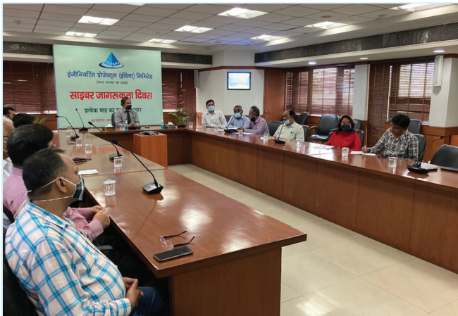
CYBER AWARENESS DAY